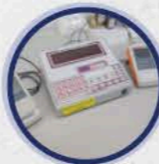
Thickness Testing Machine