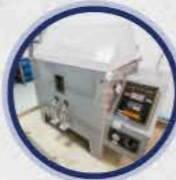
Salt Spray Testing Machine