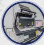
X-ray Testing Machine