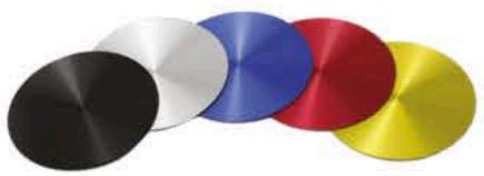
Clear and Colors Anodizing on Aluminum Parts