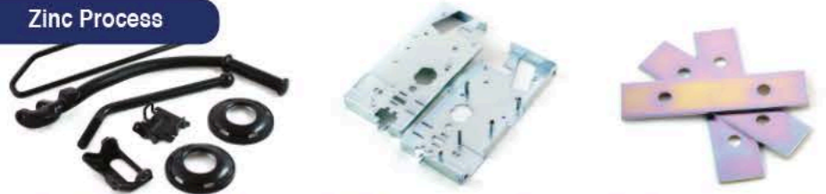
Black Chromate on Metal Parts Blue Chromate on Metal Parts Yellow Chromate on Metal Parts