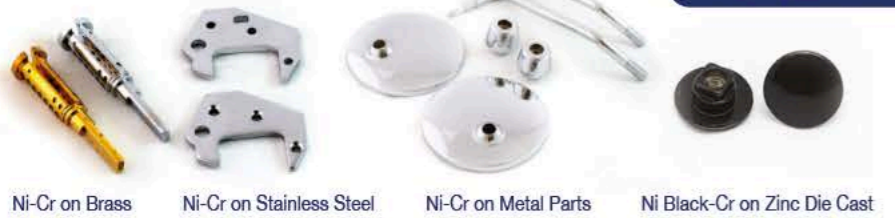
Ni-Cr on Brass Ni-Cr on Stainless Steel Ni-Cr on Metal Parts Ni Black-Cr on Zinc Die Cast